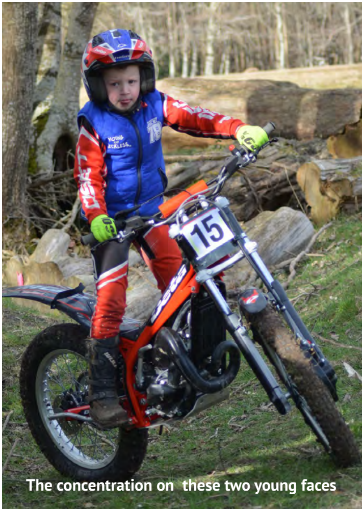
The concentration on these two young faces