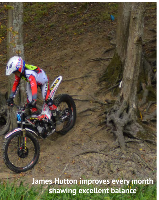
James Hutton improves every month shawing excellent balance