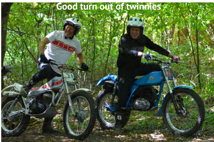
Good turn out of twinnies

the man to beat, and they saw their chances grow. Not very sporting, but taken in good heart!