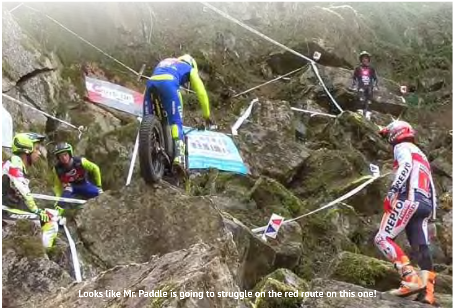
Looks like Mr. Paddle is going to struggle on the red route on this one!