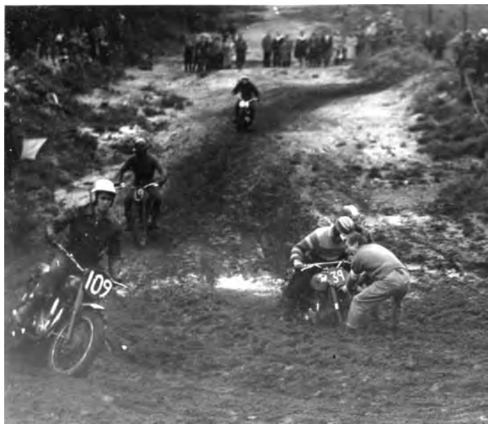
First scramble at Midhurst 1960 that's me 109