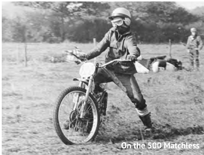
On the 500 Matchless

1966 I won the best Novice on a 350 AJS and moved to Expert at trials.