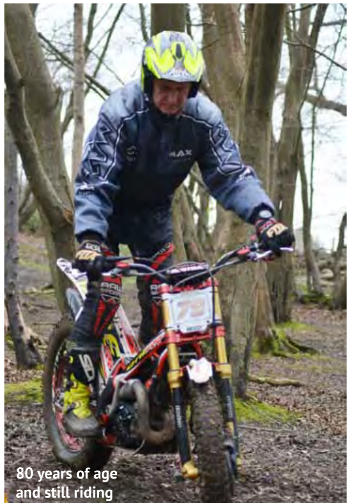
80 years of age and still riding

Here we are today 80 years of age and still riding.