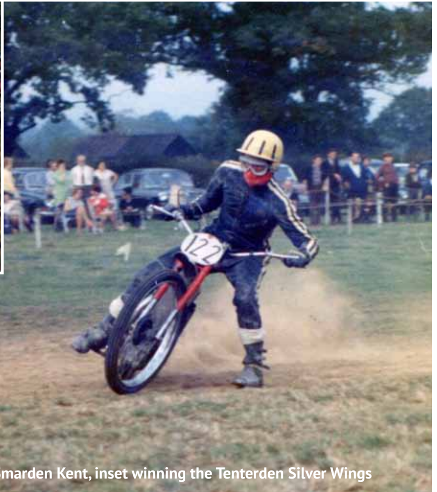
On the home built 500 4b JAP at Smarden Kent, inset winning the Tenterden Silver Wings

and had some good rides until I blew the engine to smithereens at Rhodes Minnis.