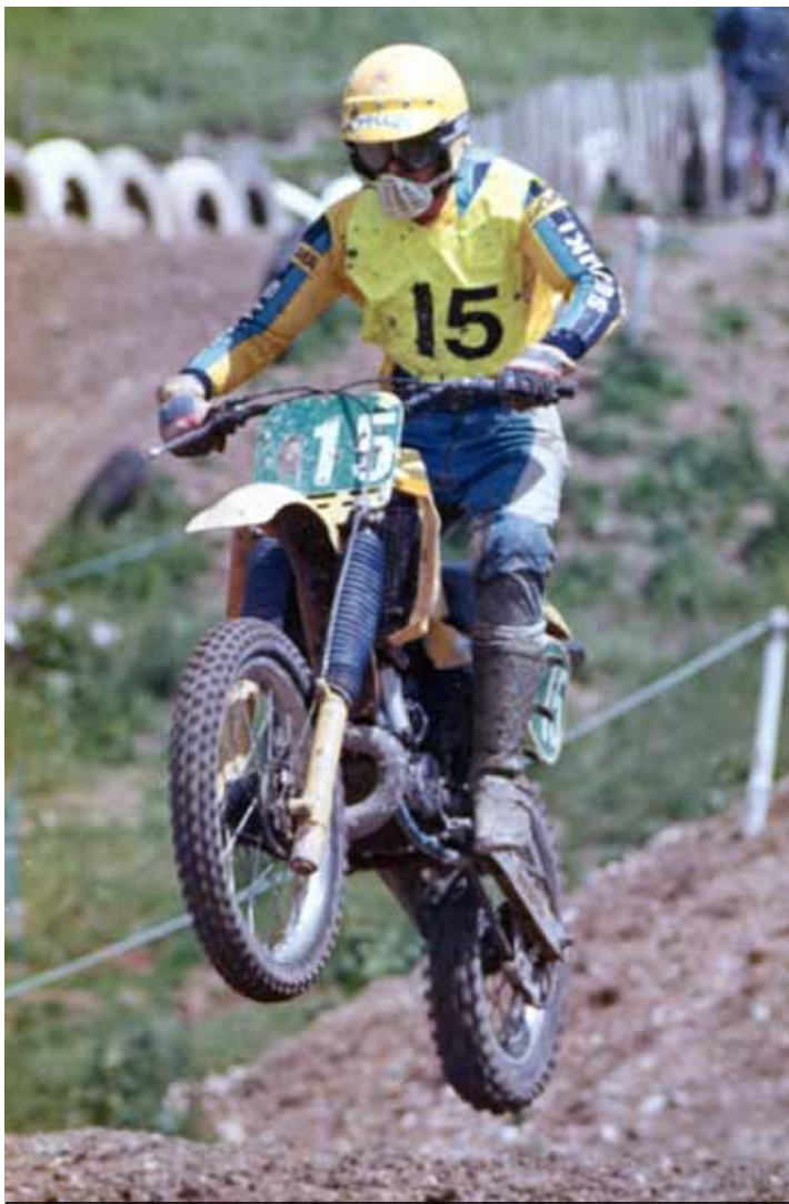
On the RM 250 Suzuki at Golding Barn AMCA days