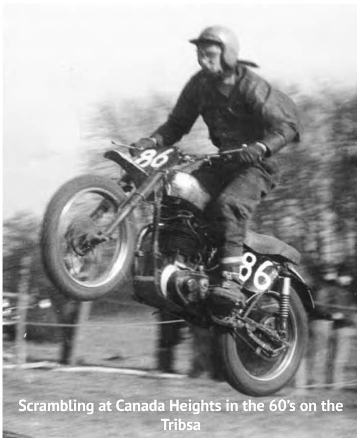
Scrambling at Canada Heights in the 60's on the Tribsa